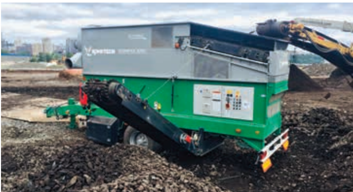
Using a patented system of pressure and suction blowers, the Stonefex removes up to 95% of stones and heavy objects from your material.