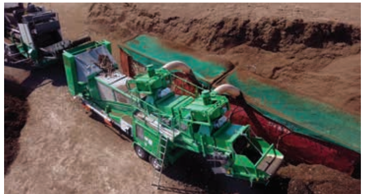
Efficiently separate plastic contamination directly into external containers for simple and easy disposal.