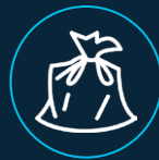
MUNICIPAL SOLID WASTE (MSW)