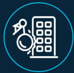
CONSTRUCTION AND DEMOLITION (C&D)